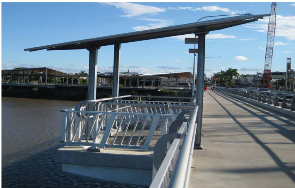
Figure C8-1: Providing attractive and useable facilities improves tourism potential, particularly in regional areas

Attractive, user friendly and efficient transport infrastructure systems encourage liveability and tourism (Figure C8-1). This in turn contributes to the economic wellbeing of surrounding residential, commercial and industrial areas, as well as the community as a whole.