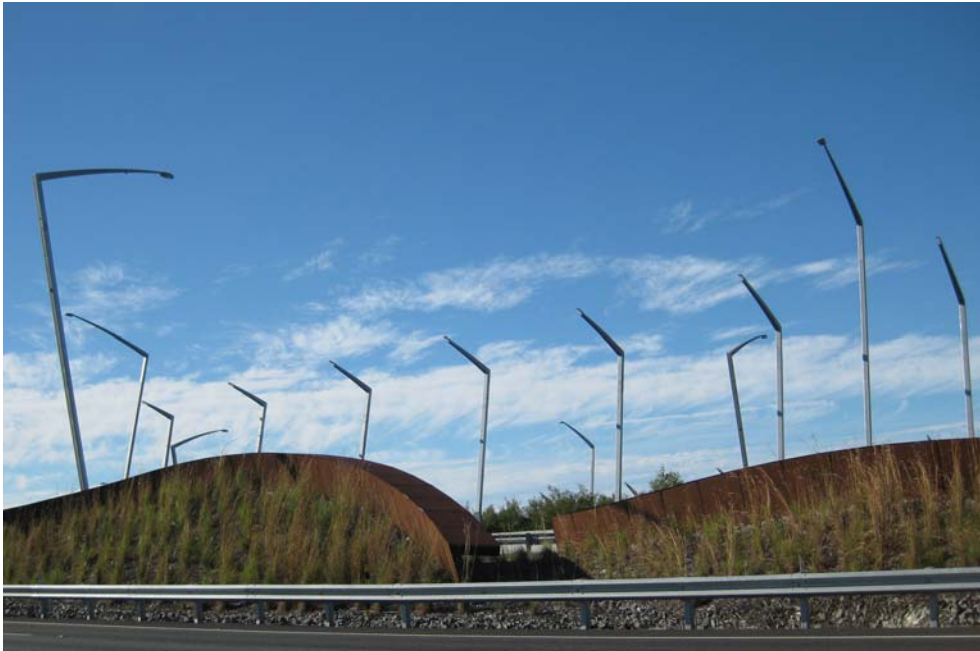
Figure C8-3: Unique entries are important in improving tourism identity and potentially stimulate the local economy