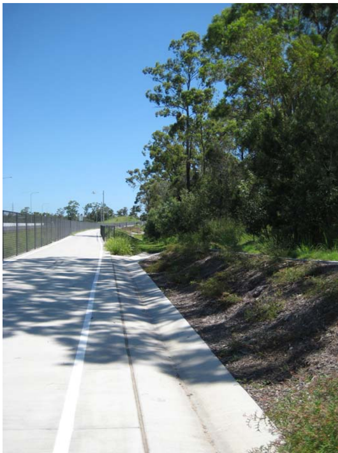
Figure C8-4: Landscape treatments creating shade and improving amenity value for pedestrians and cyclists