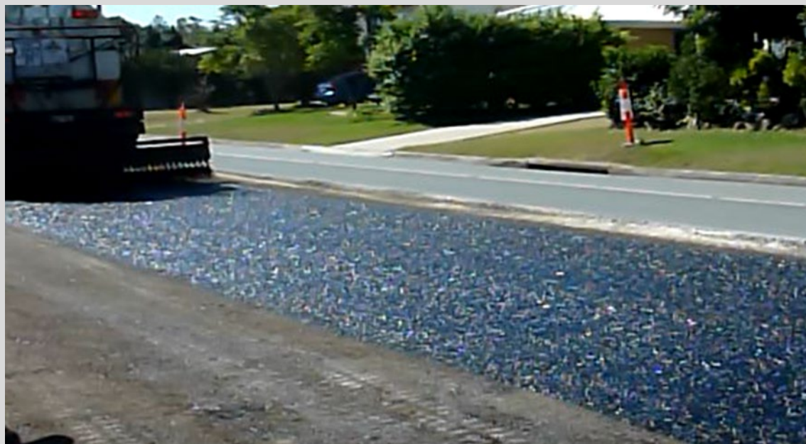
Figure 8.6.2 – Example of C170 bond coat sprayed on a prepared pavement surface

As a guide, the bitumen bond coated surface shall have a 'mirror' effect, which can be observed and assessed by the Administrator.