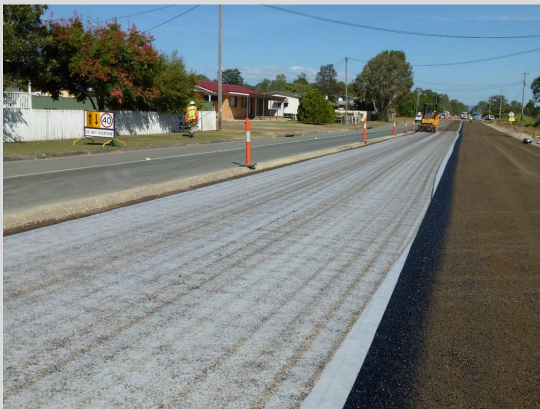
Figure 8.7.3(a) – Example of rolling geotextile using a multi-tyred roller

As a guide, the black boot prints of workers over the freshly installed geotextile can be considered as good indication the sufficient bond coat has impregnated into a permanent geotextile backing.