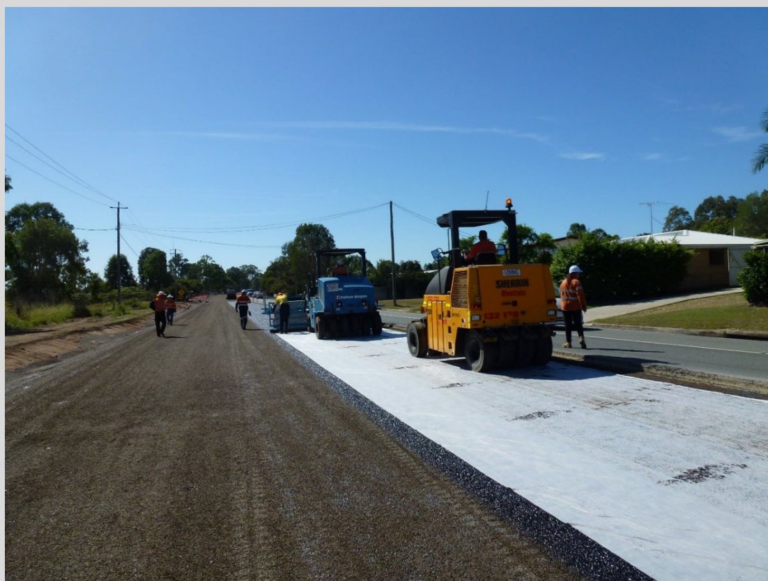
Figure 8.7.2 – Example of installation of geotextile using application frame attached to multi-tyred roller

Manual hand installation shall be carried out only in areas where it is impractical to use machinery.