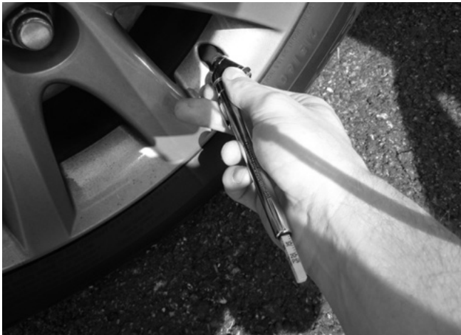
Incorrect inflation is the number one enemy of a tyre.