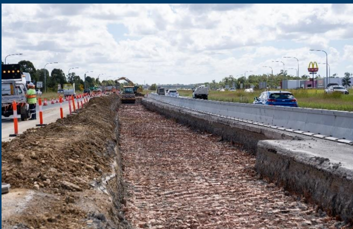
Earthworks underway for the new northbound Exit 152B from the Bruce Highway to the D'Aguiar Highway.

The project team thanks motorists and the surrounding community for their patience and cooperation as we implement these important traffic changes.