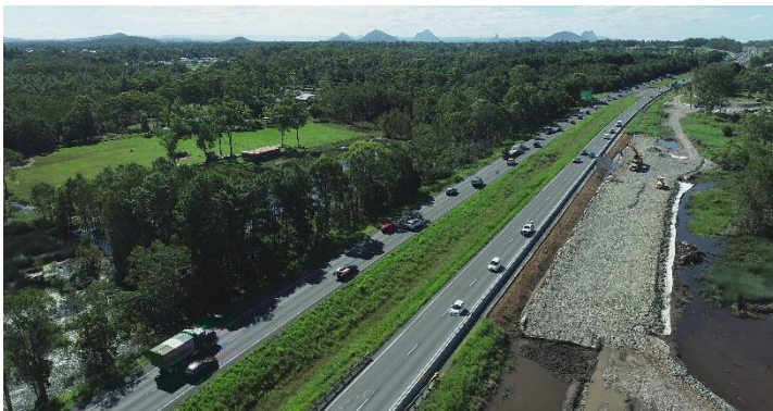
Bruce Highway southbound carriageway works looking north from King John Creek.

More favourable weather conditions in April saw the project make good progress, with ongoing earthworks, drainage installation, retaining wall construction and bridge work preparations continuing across the site.