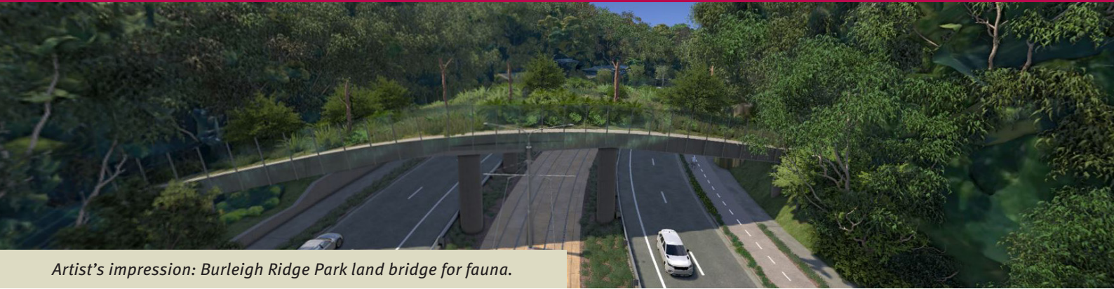
Artist's impression: Burleigh Ridge Park land bridge for fauna.

Gold Coast Light Rail Stage 4 will deliver a 13 kilometre extension south of Light Rail Stage 3, linking Burleigh Heads to Coolangatta, via the Gold Coast Airport. It will provide 14 stations between Burleigh Heads and Coolangatta as identified through the Burleigh Heads to Tugun and Tugun to Coolangatta Multi-modal Corridor Studies.