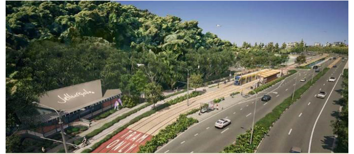
Artist's impression: Light Rail at Burleigh Head National Park and Jellurgal Aboriginal Cultural Centre.

Throughout all phases of the project, detailed environmental investigations and studies will be undertaken to ensure all potential impacts and environmentally significant areas are identified and appropriately managed. This includes ensuring that all Australian and Queensland governments' statutory requirements related to the environment are satisfied.