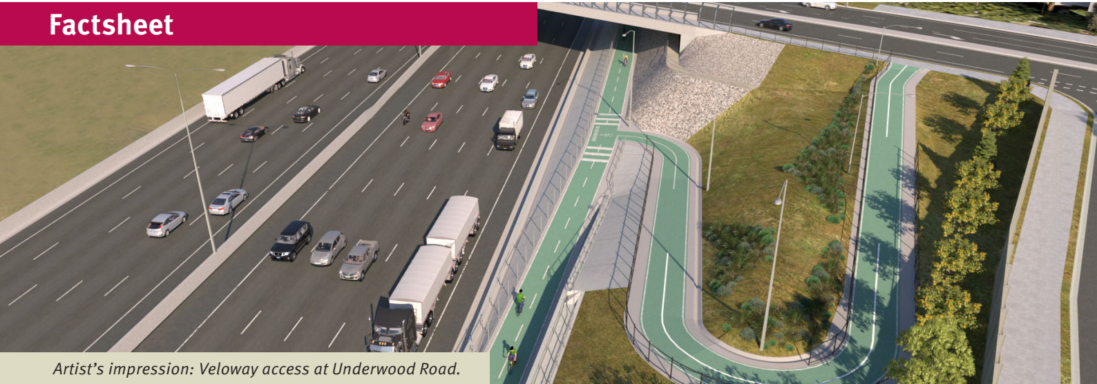
Artist's impression: Veloway access at Underwood Road.